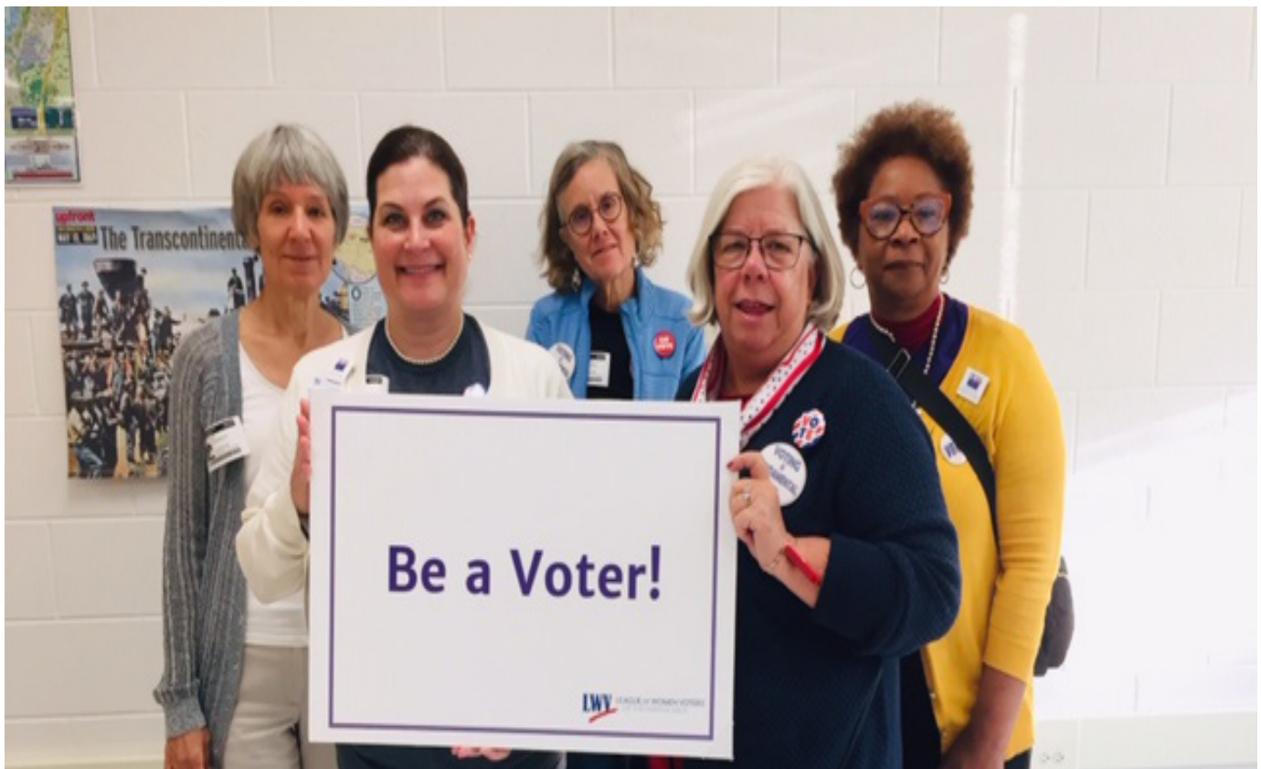
Both photos: LWVFA members urge people to vote in this year's elections