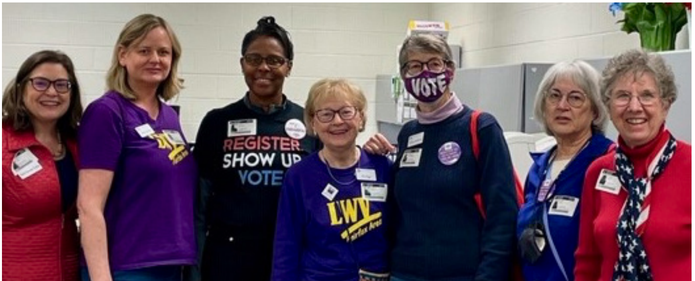
LWVFA members urge people to vote in this year’s elections

Please donate today! Donate online: www.lwv-fairfax.org/donate